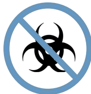
Items contaminated by patient contact