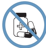
Pharmaceuticals and/or medications