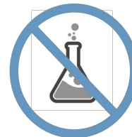
Hazardous Chemicals (including formalin/test prep solution)