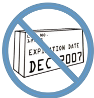
Expired Supplies (they won't get through customs)

These items are always in high demand among our recipients, both locally and internationally.