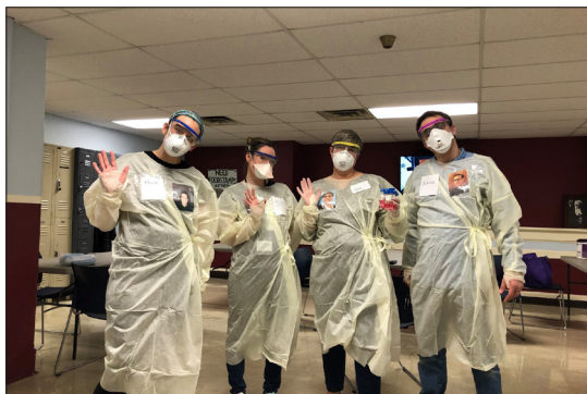
Last spring, MedWish sent the Cuyahoga County Board of Health 15,891 masks, 2,340 gowns, 25,879 gloves, 2,231 eye shields, and 30 tubs of wipes that were distributed to those on the front lines of the COVID-19 outbreak. We are grateful for this opportunity to serve our local community! Here is a behind the scenes photo from the CCBH fit testing for PPE provided by MedWish.