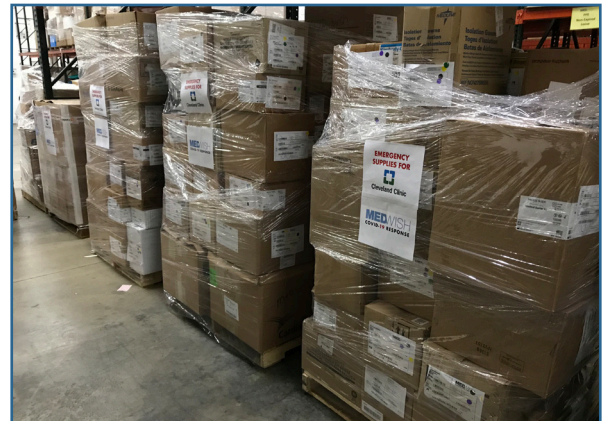
MedWish supplies ready to leave our warehouse as part of the COVID-19 response efforts.

To continue serving local communities, MedWish has partnered with Neighborhood Connections as part of the Greater Cleveland COVID-19 Rapid Response Fund. Through this partnership, MedWish receives, stores and distributes supplies needed by local social service agencies and nonprofits. These efforts provide continued support to those who need it most.