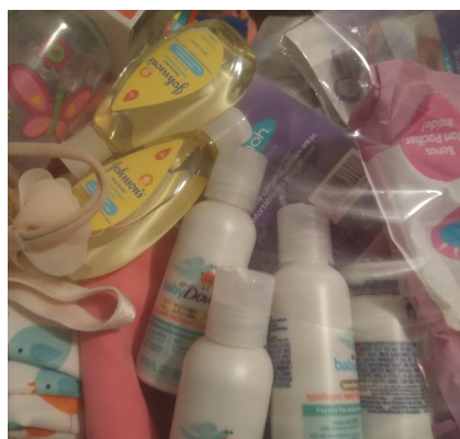
An expectant mother attending the event and items in the distributed hygiene bags.