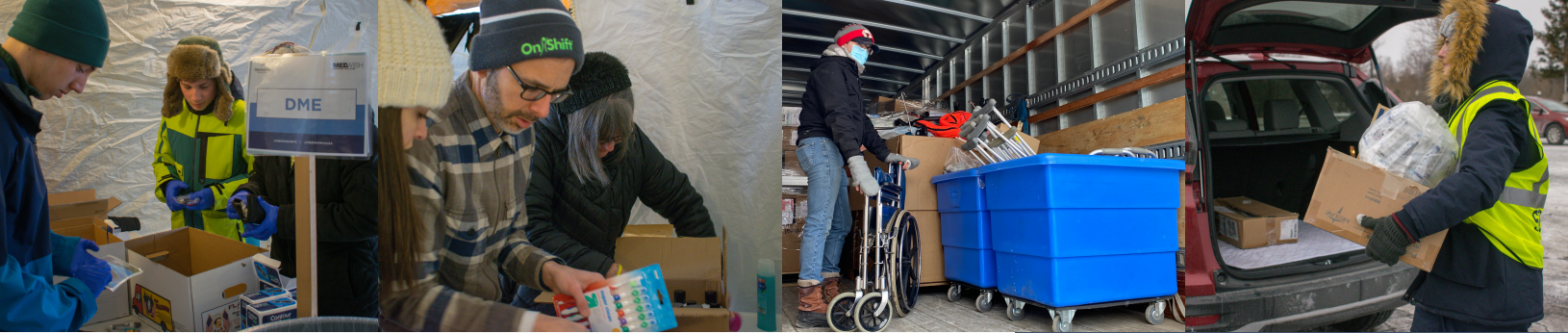
Volunteers sorting through supplies on-site during the supply drive.