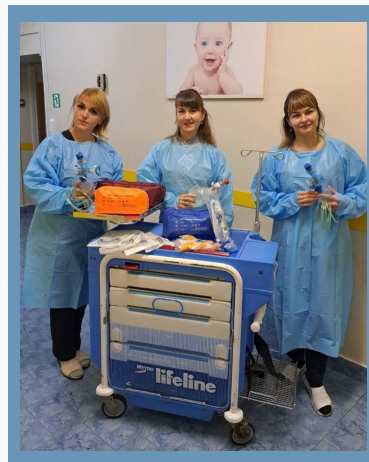
Crash carts ready for shipment in the MedWish warehouse for use in Ukraine.