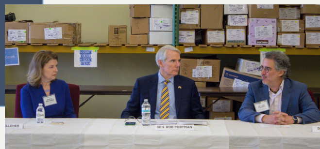
Senator Rob Portman and others on a tour of the MedWish World Headquarters + our roundtable discussion.