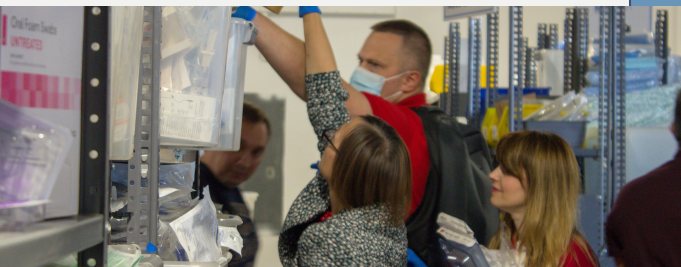
A group of Ukrainian delegates visiting MedWish with Global Ties Akron packing supplies to take back with them to Ukraine.